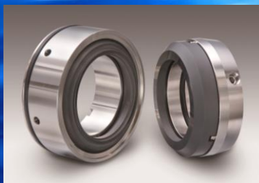
Oil & Gas, Steel, Food & Beverage/ Pharmaceutical, Water, Paper