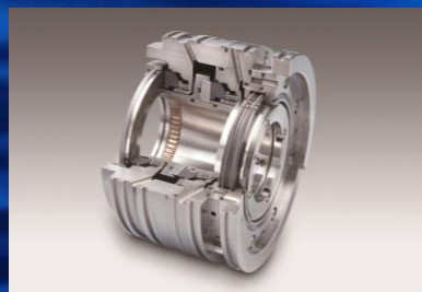
Energy, Oil & Gas, Steel, Refinery/Petrochemical

These environmental devices prevent oil, solvent, refrigerant and other fluids from leaking from machinery, or controls the flow and pressure of fluids to contribute to environmental and energy conservation globally.