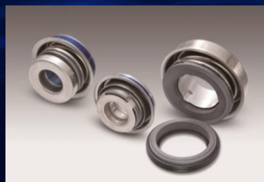
Automotive, Construction Machinery