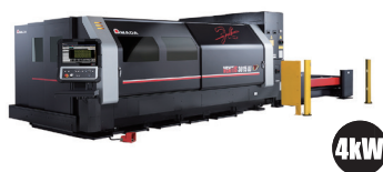
Fiber laser Machine Equipped with LBC Technology VENTIS AJ SERIES