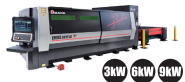
Fiber Laser Machine Equipped with ENSIS Technology ENSIS AJ SERIES