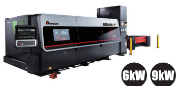
3-axis Linear Drive Fiber Laser Machine REGIUS AJ SERIES