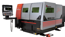
All-around Fiber Laser Machine BREVIS 1212 AJ