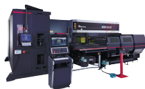
Fiber laser-equipped blanking process integrated solution ACIES-AJ series